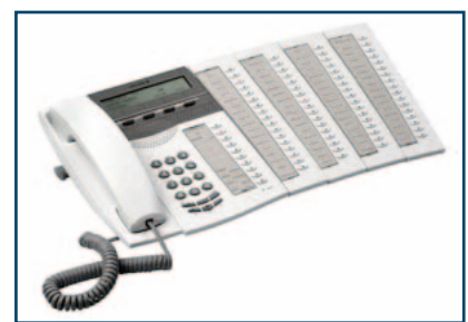
Ericsson Dialog 4000 Digital Telephone

Ericsson Enterprise AB SE-126 25 Stockholm www.ericsson.com/enterprise