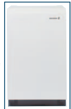
Ericsson BusinessPhone 250

The central system is comprised of between one and three wall-mounted cabinets, each with nine board slots, which can cater to between 20 and 200 extensions (or 300 for the special Hospitality solution). Each cabinet has a built-in transformer with the option of a battery back-up unit or alternative DC power supply.