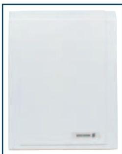
Ericsson BusinessPhone 50

BP128i is a single, compact cabinet with five board slots. Since it is possible to stack two systems, it can serve up to 128 extensions and 60 trunks. The cabinet has a built-in switched mode power supply.