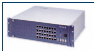
Ericsson BusinessPhone 128i